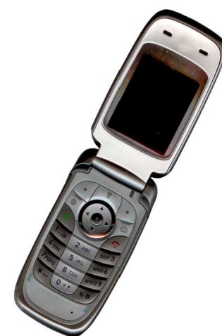
Fig. 3. Example of an image with acceptable resolution