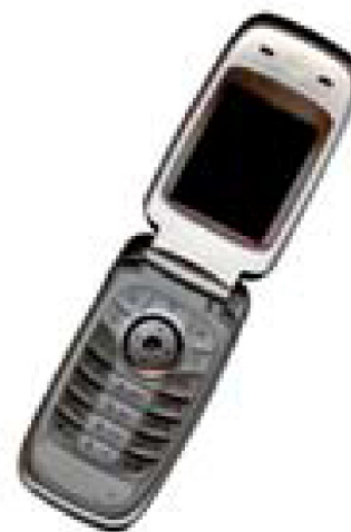
Fig. 2. Example of an unacceptable low-resolution image